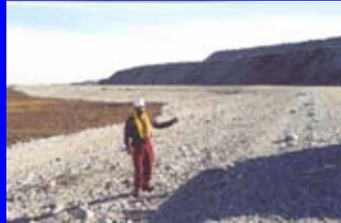
Caribou friendly roadside