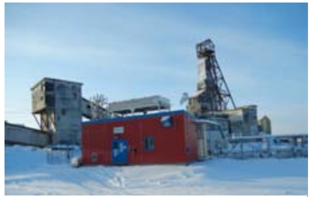
Giant Mine in March 2012