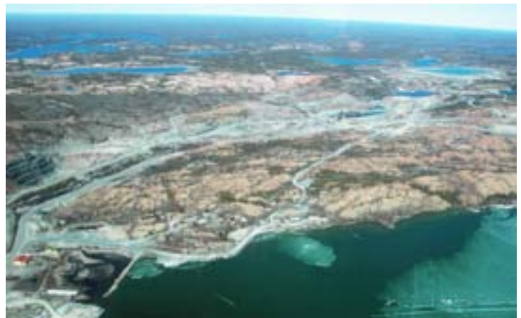
Aerial view of Giant Mine in summer