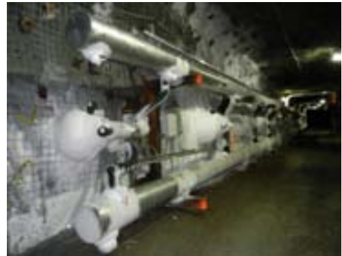
Freezing system underground at Giant Mine