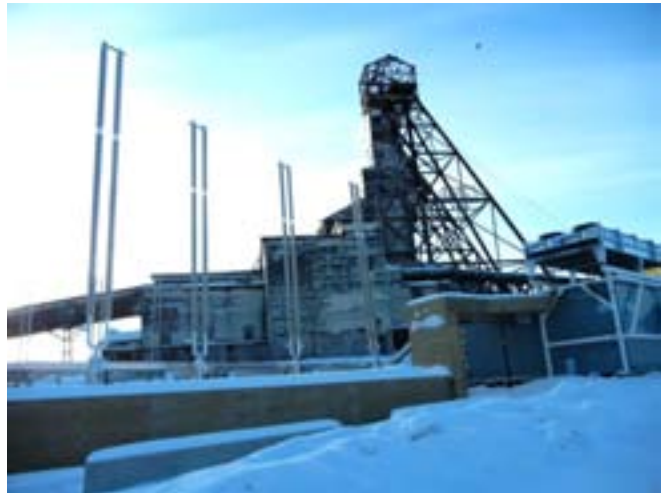
Thermosyphons at Giant Mine

There are also commitments to establish an environmental management system working group as well as a First Nations and government body. This latter body is discussed in the developers' assessment report (DAR) but has yet to be defined. Third party audits and public performance reporting are also commitments made by AANDC.